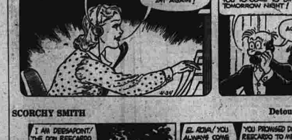
BY MBRILL BLOSSER