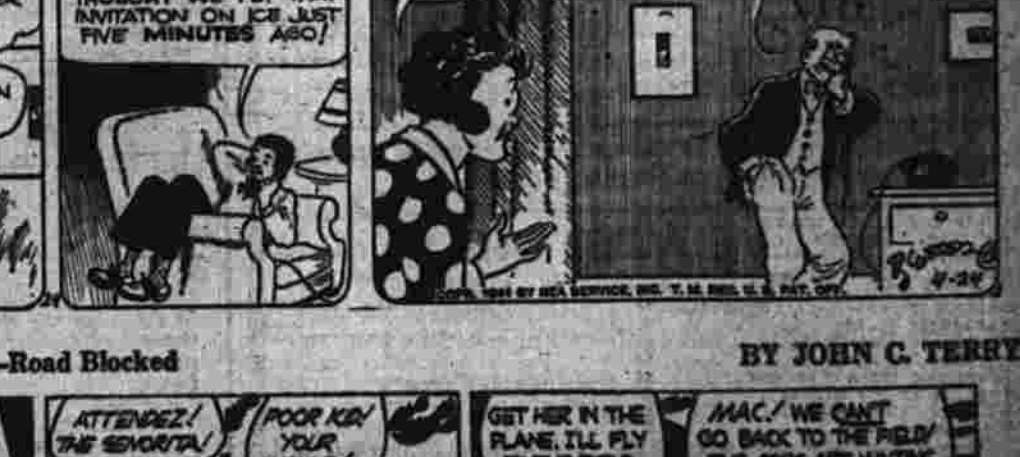
BY MBRILL BLOSSER