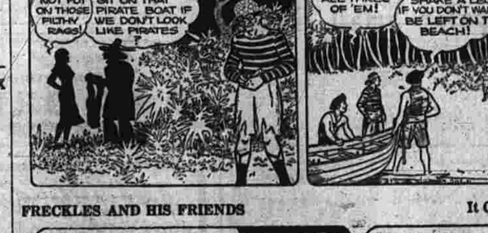
BY V. T. HAMLIN