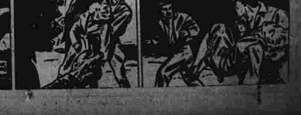
BY JOHN C. TERRY

Glacier Park Surpasses Alps in Scenic Wonders. QIXTY glaciers give Glacier National Park its name, but they contribute only a part of the scenery for which this area is famous. A glimpse of Glacier's grandeur is pictured on the U. S. 8-cent stamp, above, of the National Parks series. The stamp design shows Two Medicine Lake with Mount Rockwell in the background. This view near the east entrance, is one of the best known to tourists. Glacier National Park is located in northwestern Montana, adjoins Canada's Waterton Lakes National Park, directly across the international border. The park covers an area of 1,534 square miles, was created in 1910. There are 19 principal valleys in the park, many of which have not been fully explored, and 250 known lakes. Mt. Cleveland, 10,438-foot peak in the northern part of the park, is the highest point. The continental divide traverses the entire length of the park.